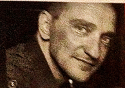
Rodolfo Dordoni for Minotti

product Leslie standout The sinuous lines of the sofa's solid oak frame and cast-aluminum feet establish an intimate conversation spot. througharchitecture.com. circle 208